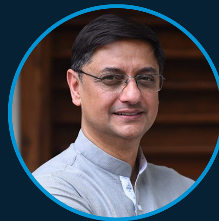
SHRI. SANJEEV SANYAL Secretary to PMO & Member Economic Advisory Council to the Prime Minister