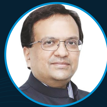
SHRI GOVIND MOHAN, IAS Secretary Minister of Culture Govt. of India