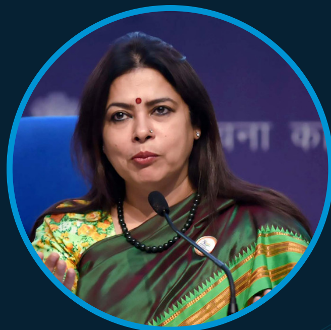
Chief Guest SMT. MEENAKSHI LEKHI Minister of State for Culture and External Affairs Govt. of India

UNDER THE UMBRELLA OF Emerging insights on human histories and past environments in South Asia