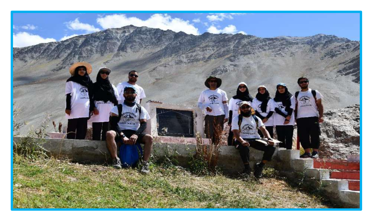
Students Exploring the Uftii Fort Zanaskar (Padum)