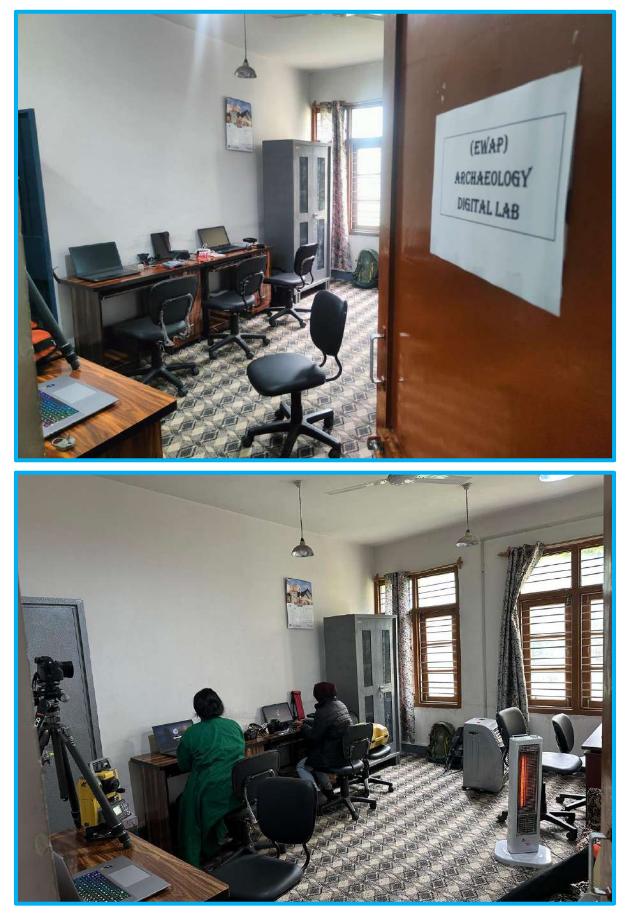
Endangered Wooden Architecture Program (Archaeology Digital Lab)