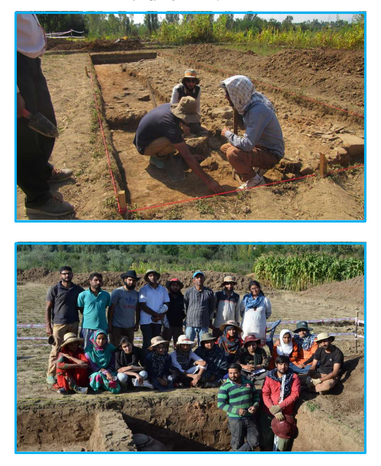
Best Practices Surveying/Exploration/Excavation