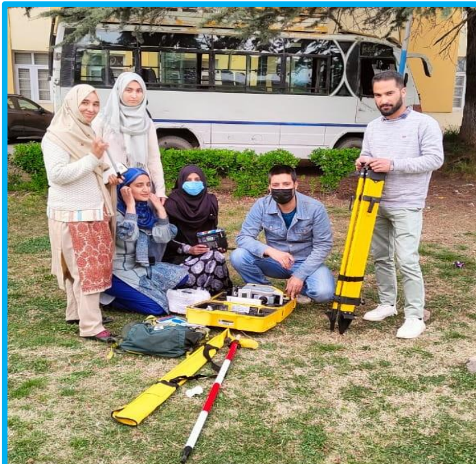
Students training session with Total Station Surveying training.