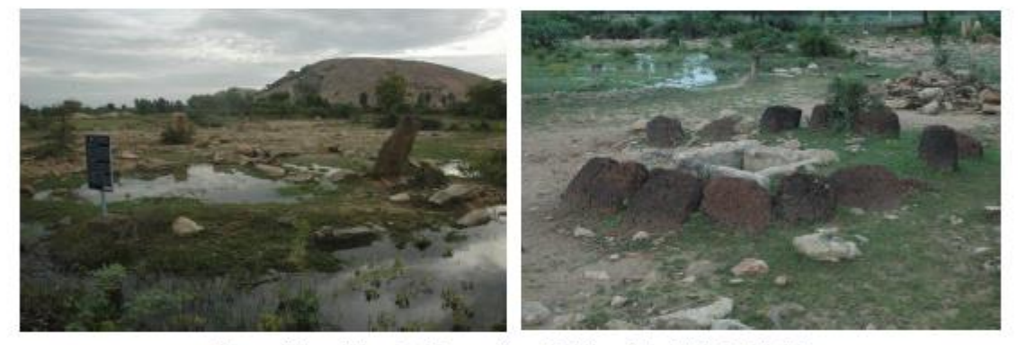
The megalithic-period tombs of Sittanavasal, near Pudukkottai (Tamil Nadu, South India)

Tuesday 4<sup>th</sup> of December 2018 Maison de l'Asie, Paris (22 avenue du Président Wilson, 75016, Paris), Grand Salon