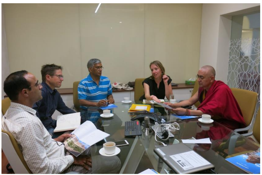
MAFIL Stakeholders during a meeting at the French Institute in New Delhi, 5th of July 2018.